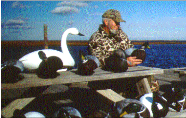
Decoy carvers sell their wares and compete for prizes.

Shore Waterfowlers Association, one of Long Island's oldest conservation groups, decided they needed a way to share their thoughts on the many challenges faced by those who hunt ducks on Long Island. The combination of low-growing saltmarshes, ever-changing tides, ice and wind demand specialized craft from which to hunt. The need to carry dozens of decoys, to remain hidden, to be safe and comfortable, inspires creative solutions. Over the years, the event has grown to involve much more than a collection of hunting craft, but the Duckboat Show remains the heart of the Festival. It gives anyone the opportunity to see dozens of fully equipped boats, and to talk with their owners. The boats are displayed on their trailers and not in the water so they may be closely inspected, and so all can gather 'round with some hot coffee, ask questions, and perhaps tell a story or two.