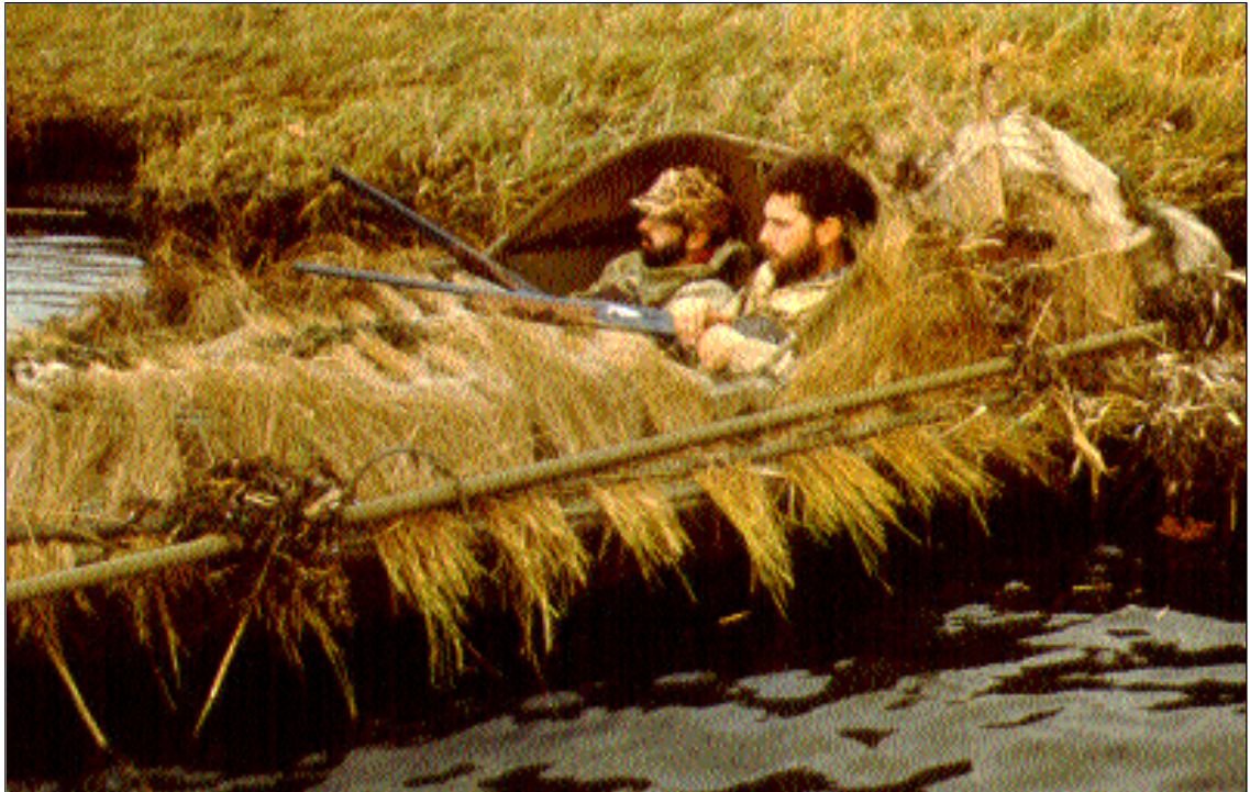
Grassboats come in many shapes and sizes, but should blend with the saltmarshes.

Article and photographs by Steven Jay Sanford