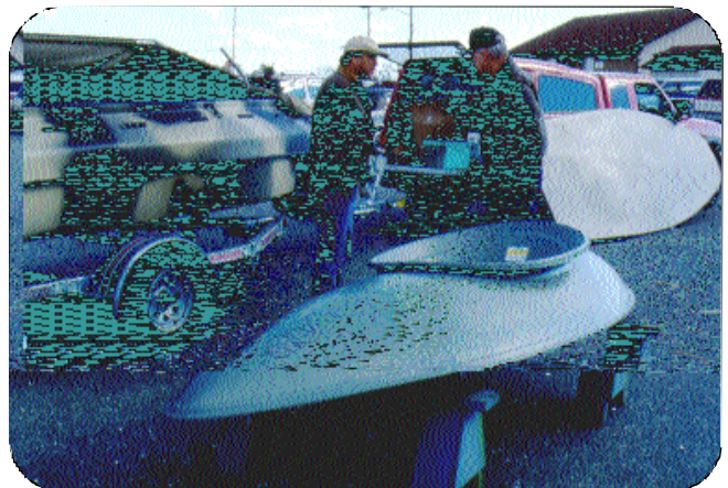
Built to blend in with the waves, layout boats are designed for hunting diving ducks in the open bay.

The Festival began as a duckboat competition in the early 1980s. Members of the South